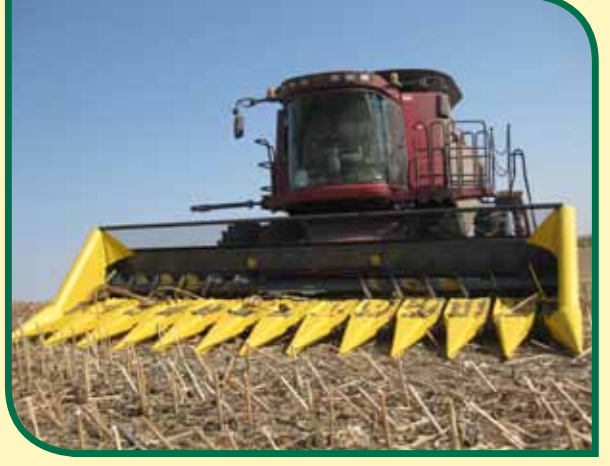
Fantini Headers Will Work On Any Model Of Combines

The unique features of these heads are the rubber block gathering chains that hold the stalk straight up instead of leaning them over and shaking the seeds out of the heads. The speed of the head can be matched to combine ground speed for a nice even flow in to the combine. The knives are a circular rotating knife that cuts the stalk off in front of the gathering chains without jarring the head. The pan design will catch any seeds that may have been lost and flows them back in to the header auger. The auger design has deep flighting that helps feed all the stalks and heads down the length of